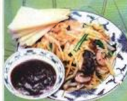
Moo Shu Pork