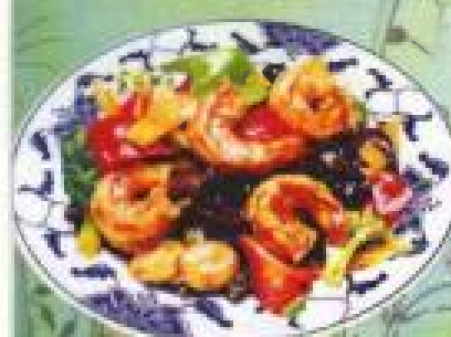
Shrimp w. Garlic Sauce