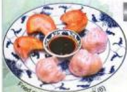
Fried or Steamed Dumplings (8)